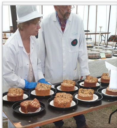
Judging a vast array of cakes, biscuits, scones and toffee .....