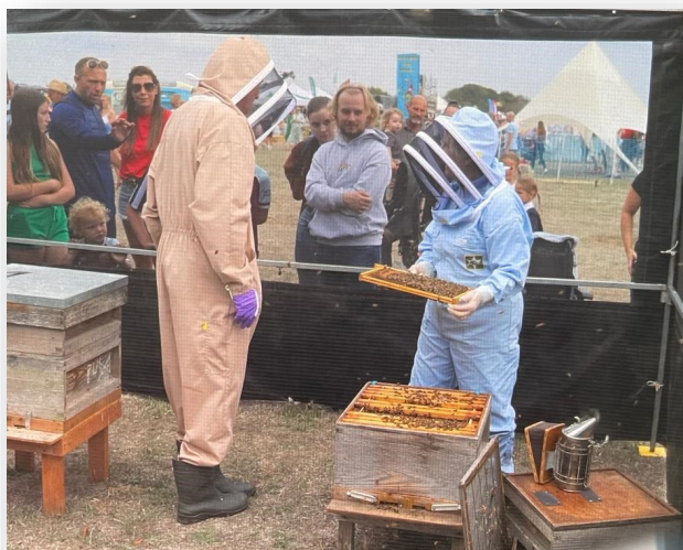
The live demonstrations - always a big crowd