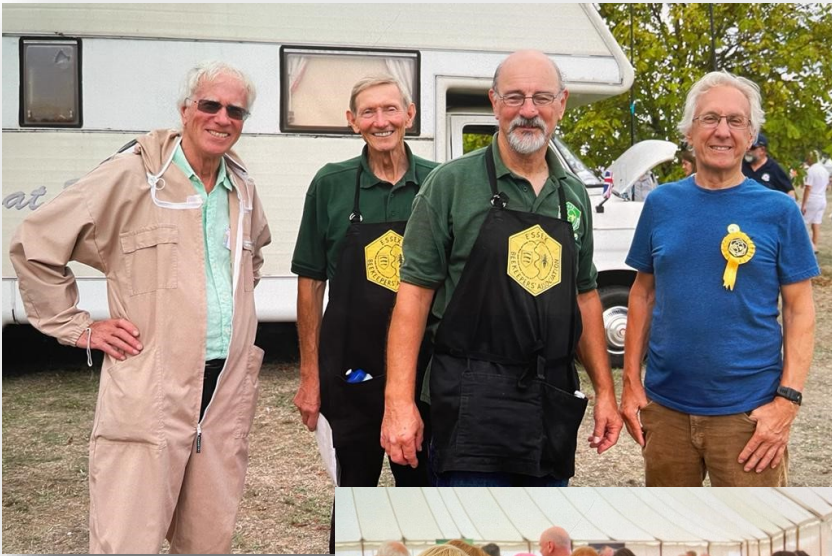
Different activities around and in the marquee