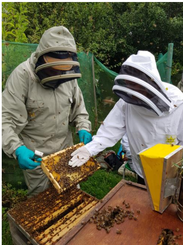
Photos taken during the beginners beekeeping course